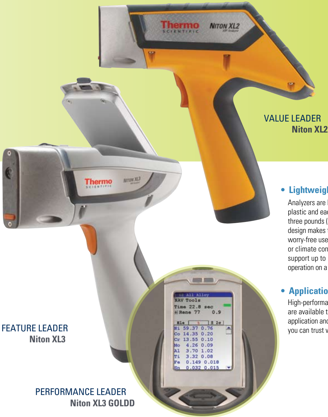
VALUE LEADER Niton XL2